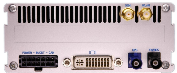
Base unit rear panel connections (rectangle shows available area for custom connections)